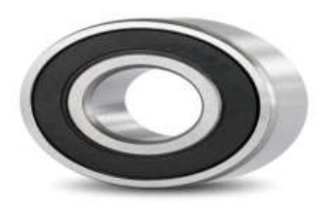
IV. CAD DESIGN

A Ball Bearing is a type of Rolling Element Bearing that Uses Balls to Maintain the Separation between the Bearing Races. The Purpose of a Ball Bearing is to Reduce Rotational Friction and Support Radial and Axial Loads. It Achieves this by Using at least three Races to Contain the Balls and Transmit the loads through the balls. In Most Applications, One Race is Stationary and the Other is Attached to the Rotating Assembly.